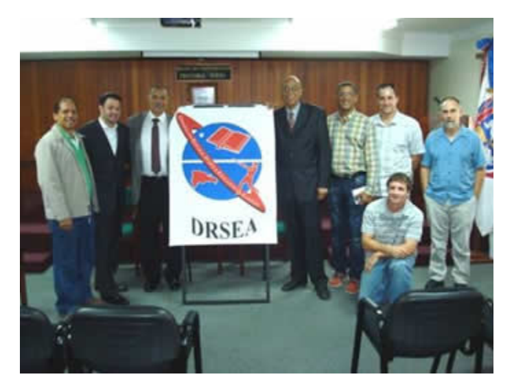
2010 DRSEA retreat in Dominican Republic

In 2004, I was part of a group that held a conference in the Dominican Republic on Latino participation in the sports industry. We invited prospects from MLB teams to sessions on financial planning, on picking a sports agent, on acculturation. I will never forget that the first question asked by one of these prospects was, "How do I open a bank account?"