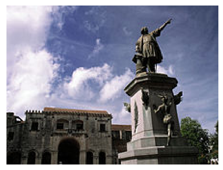
Columbus Park in Santo Domingo

I do agree with him that the "African American Experience" is shared by the Dominican Republic and the United States, including the history of slavery in which both became melting pots of Europeans, Africans and native people. Santo Domingo can actually claim the dubious distinction of being the first city in the New World to bring slaves from Africa, in 1502. Between then and 1866, 11.2 million Africans were "imported" to the Americas. Of those, only 450,000 were destined for what would become the United States of America.