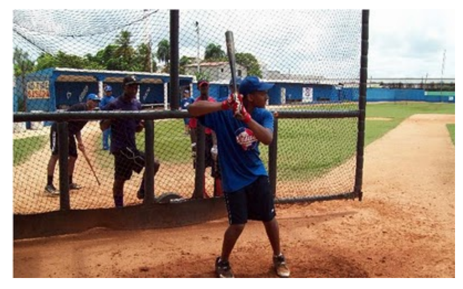
Batting practice at the Arias & Goodman Academy

The program is heavy on developing conversational English, as well as critical thinking and life skills, but also provides general education in math, history, geography, art, health and nutrition, financial planning and acculturation. This broad spectrum will allow the Arias & Goodman Academy prospects to develop skills in conceptualizing, analyzing, evaluating and applying information that they are exposed to; to make them better able to handle a multitude of decisions that will be coming their way as they mature.