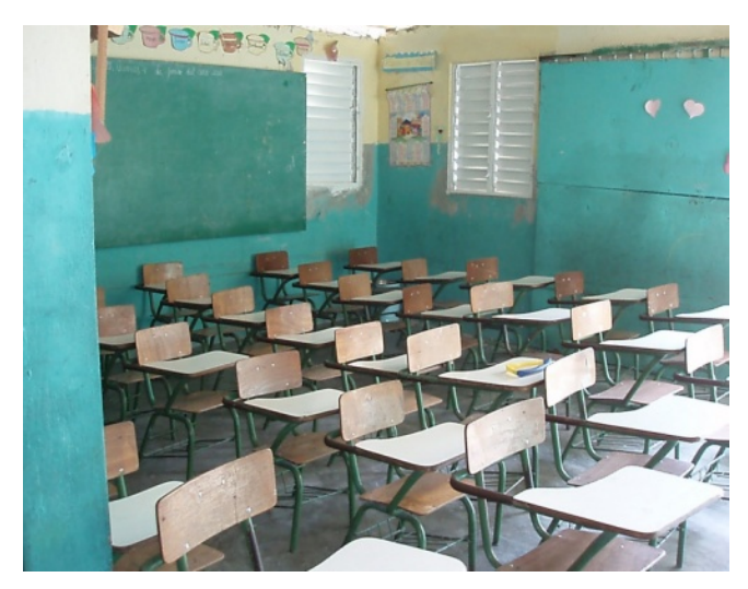
Salón de clases será equipo estándar